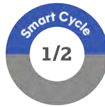
Frozen Oocyte Transfer (FOT)