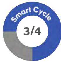
IVF Freeze-All Cycle