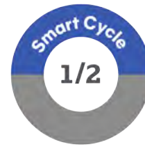
Pre-Transfer Embryology Services