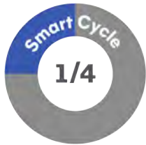
Intrauterine Insemination (IUI)