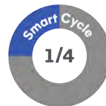
Purchase of Donor Sperm 4 vials