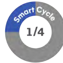
Split Cycle (Egg & Embryo Freezing) When paired with IVF cycle