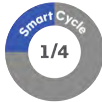
Timed Intercourse (TIC)