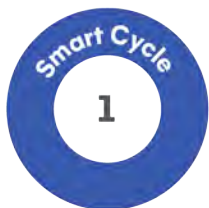
IVF Live Donor Fresh Donor services and creation of embryos including transfer to member