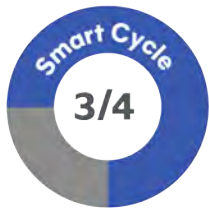
IVF Fresh Cycle

Visit the Explanation of Covered Treatments & Services section of the Member Guide to learn more. For a full explanation of what's covered under each Smart Cycle, visit the Understanding Your Coverage section.