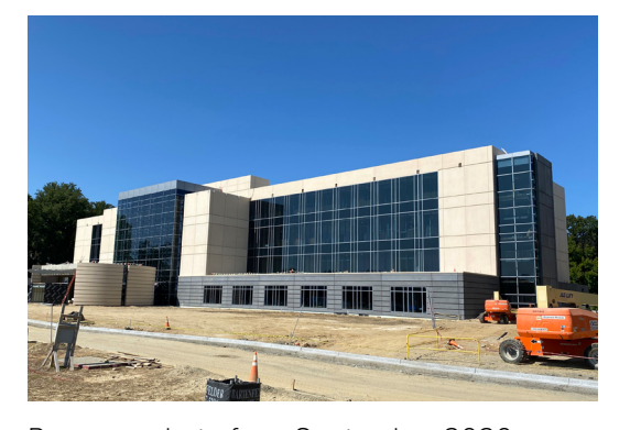
Progress photo from September 2020