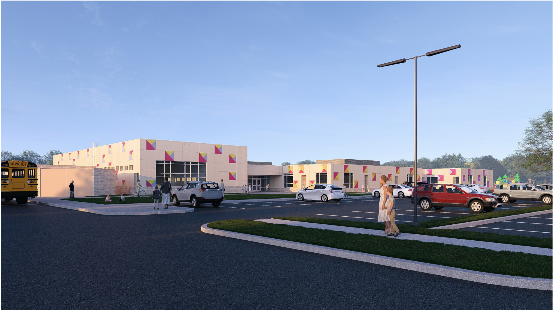
Perspective of the building from the site entrance at Marble Faun Lane