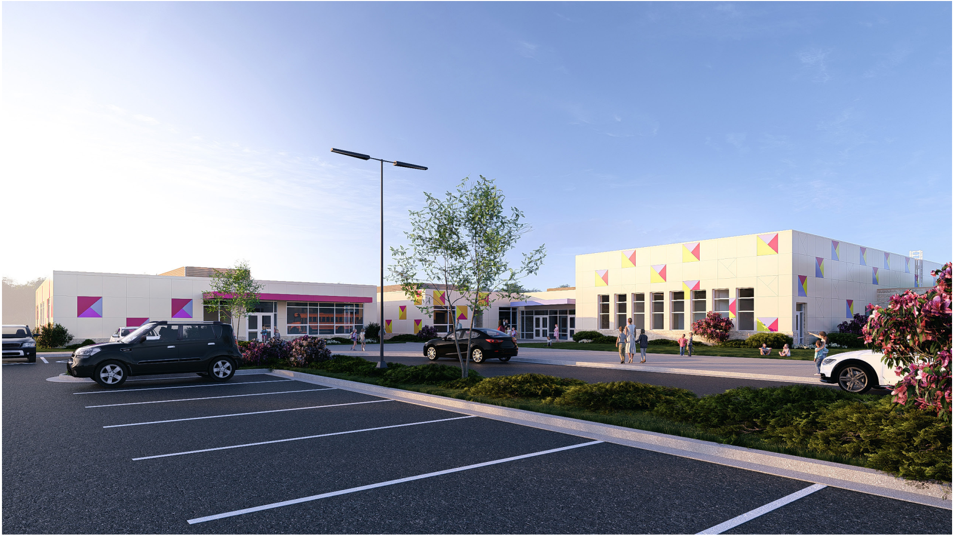
Perspective of the entrances from the visitor parking lot