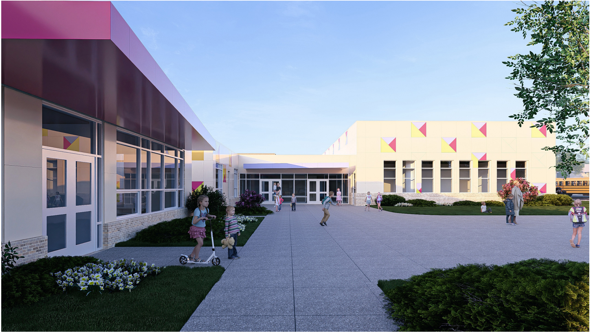
Perspective of the entrances from the north end of the head start addition