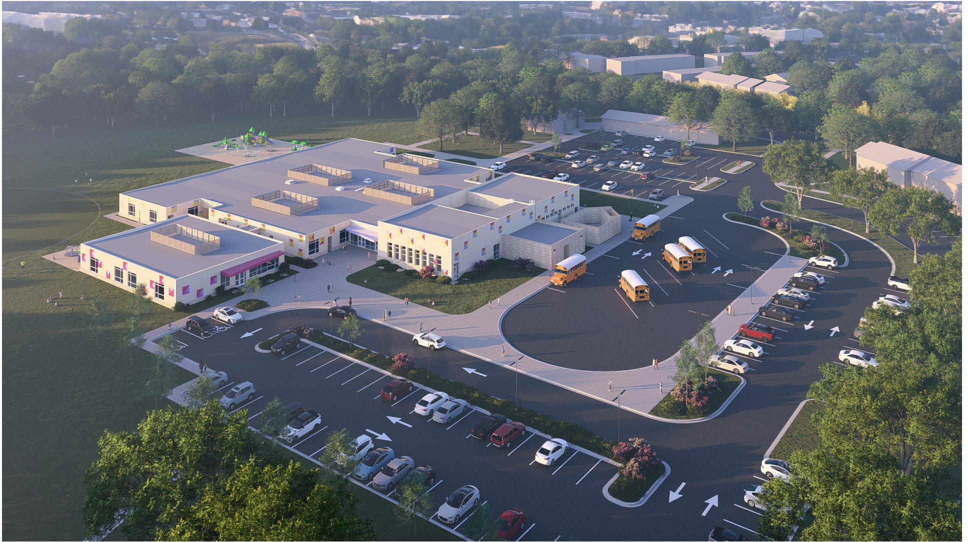
Aerial perspective of the entrances from the southwest