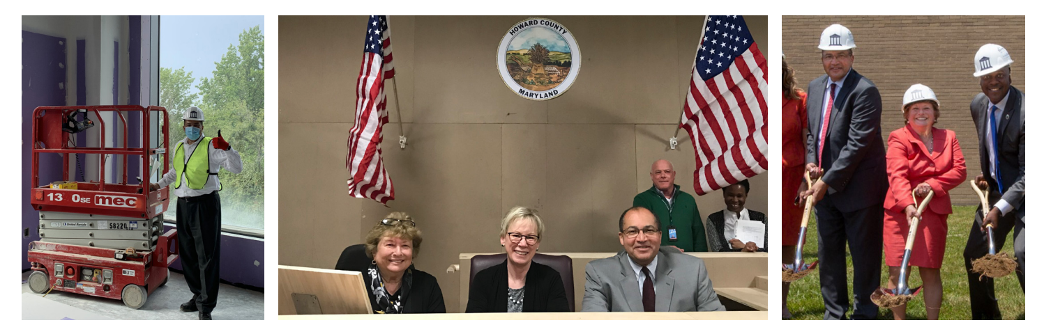
Judge Tucker is pictured above at a courthouse site tour, participating in a courtroom mock-up exercise, and at the groundbreaking.