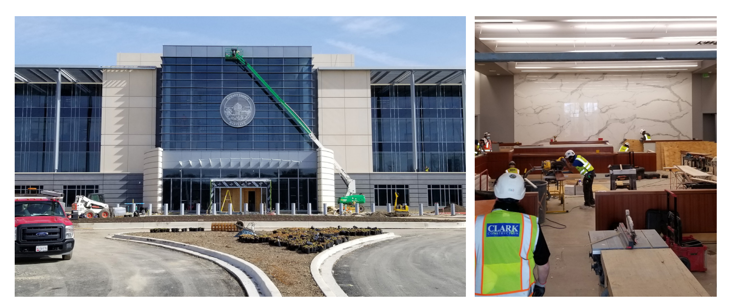
Progress photos from March 2021.