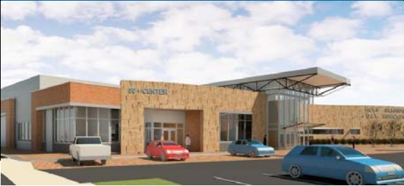
New Elkridge 50+ Center...Coming early 2018