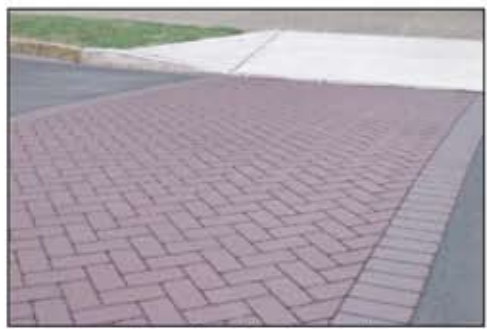
Stamped Asphalt Crosswalk